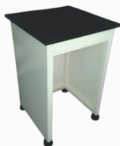
ANTI VIBRATION TABLE