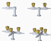
GAS VALVE, 1 To 4 WAY